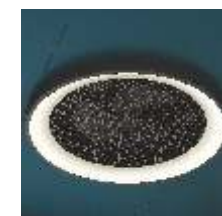
RL20 with Fan