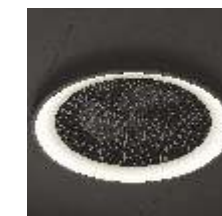
RL20 with Fan