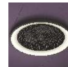
RL20 with Fan