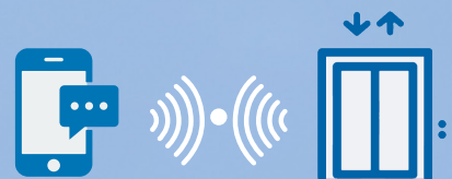
KONE Elevator Call

A TOUCHLESS AND PERSONALISED ELEVATOR EXPERIENCE AT YOUR FINGER TIPS